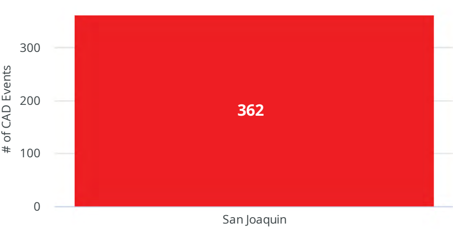
Total Calls for Service